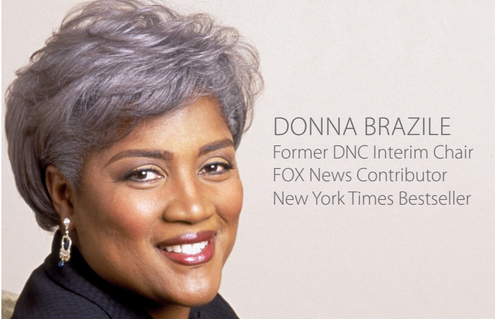
DONNA BRAZILE Former DNC Interim Chair FOX News Contributor New York Times Bestseller