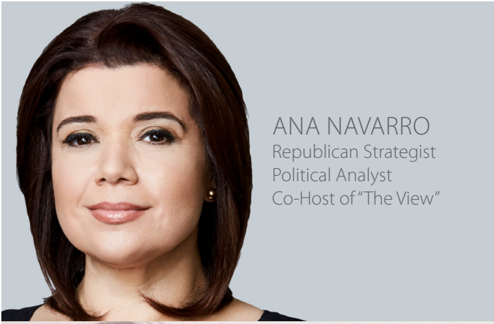
ANA NAVARRO Republican Strategist Political Analyst Co-Host of "The View"